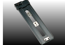
TA-Z3 Tripod adaptor