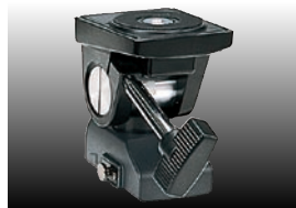
AF-30 View finder adaptor for GM-51