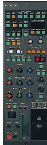
Camera Control Panel RC-Z33