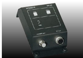
EA-Z35 Extension adaptor for CA-Z35