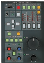
Camera Control Panel RC-Z3