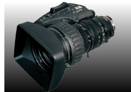
YJ19 x 9BKRS Zoom lens