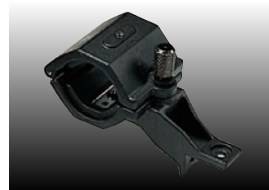
MH-Z3 Microphone holder