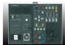
TU-Z3A Triax base station with RC-Z3 (option)