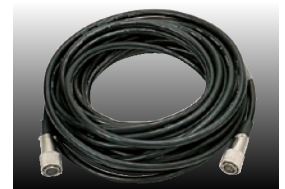
C-502KAB/C-152KAB/C-103KAB Camera cable