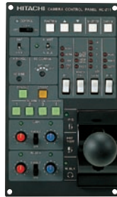
Camera Control Panel RC-Z21A