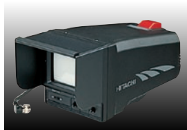
GM-51 5-inch view finder