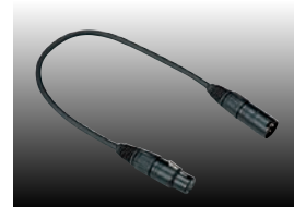
C-300MA Microphone cable