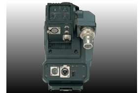
CX-Z3A Triax adaptor rear view