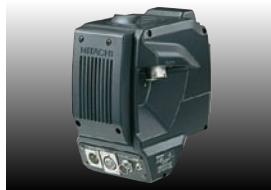
CA-Z35 Camera adaptor for RU-Z35