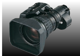
A20 x 8.6BRM-24 Zoom lens