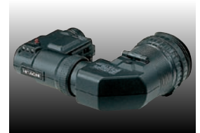
GM-9 1.5-inch view finder