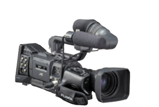
GY-HD250 ProHD 3-CCD ProHD Camcorder with 16X Fujinon Lens