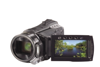
GZ-HM400 HD Memory Camera HD Everio