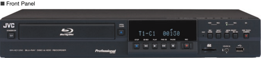
■ Front Panel